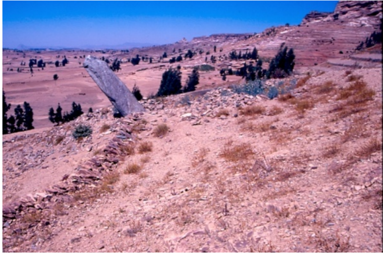
Fig. 7: Stela at Keteba

base measures 0.42m, which makes its total length to be 7.12 m. It has a varying width of 0.80 m and 0.75 m at its bottom and top, respectively. It is 0.45 m thick. Its top seems to have been chiseled by hard stones by school children.