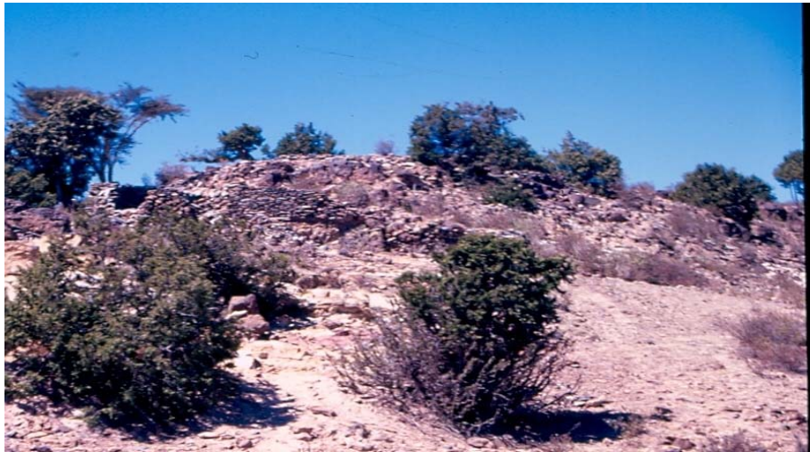
Fig.3: Mishlack Oromo

Abiy Addi: This site is located near the Habes Elementary School to the north of Mai Ayini and to the north of the road leading from the town of Atsibi to the town of Wukro, on a hilltop at 0574704 easting, 1527826 northing and at an elevation of 2635 m above sea level. It was designated as ET-21.