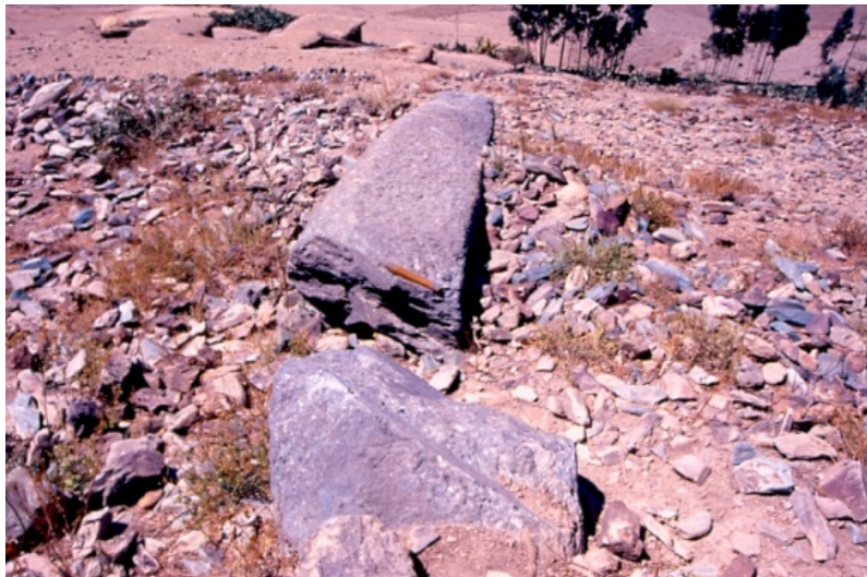
Fig.6: Broken stela at Keteba

Keteba (Mesaw'eti): This site is found to the east of ET-25 on the slope of the Eastern Escarpment in Hadnet Peasant Association. It is situated to the southeast of the rock-hewn church of Meskel Mesaw'eti and to the north west of the Church of Mariam Medhaneyti at 0576783 easting, 1547424 northing and at an elevation of 2869 m above sea level. It was designated as ET-26. It preserves a ruin that appears to be a tumulus or a burial structure, disturbed by terracing and quarrying.