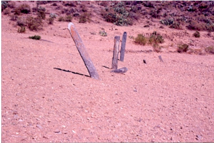
Fig.5: Stelae at Sekera.

The stelae at Sekera are the largest to be found outside the town of Aksum. This makes the same site the second largest Aksumite site in terms of numbers and size of stelae concentration.