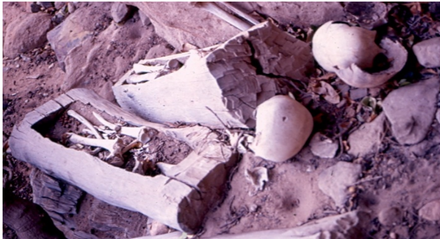
Fig. 4: Coffins at Mikael Mistwa'e

The stonewall gate of this church is found to the west. Its interior has one large room carved from limestone. Two unfinished carved windows are found to the south of the main church facing west. Human skeletons and skulls are found on the edges of the limestone caves to the north of this rock-hewn church. They are kept on rectangular wooden coffins (fig.4).