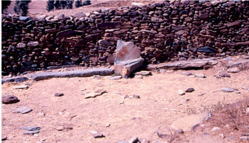
Fig. 8: Stone chair at Church of Mariam Medhaneyti