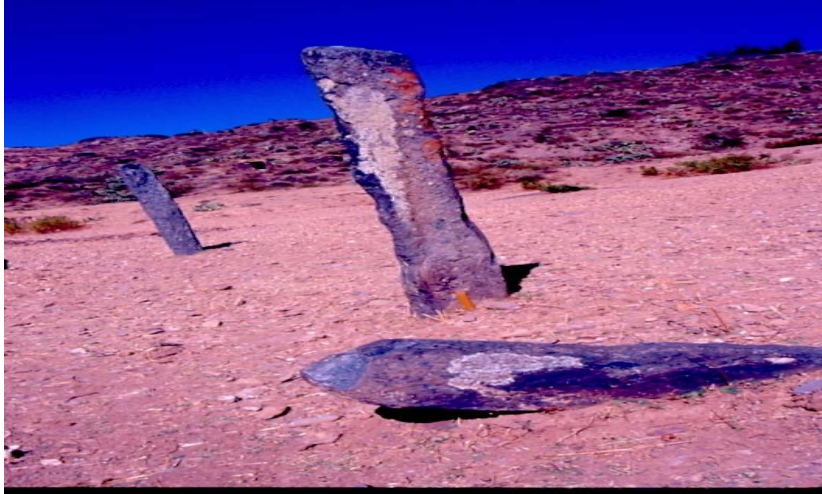
Fig.2: Stelae at Kanchabet

The first stela is found to the south of the road while the others are located to the north of the same road. The space between the first stela and the second one measures 10 m while the one between the first and the third stela measures 2.6 m. It is dressed one with pointed end, 1.80 m high and 0.70 thick with width of 0.12 m and 0.28 m at its top and bottom, respectively.