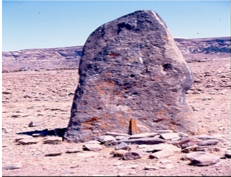
Fig.9: Stela at Estifanos Tsihe