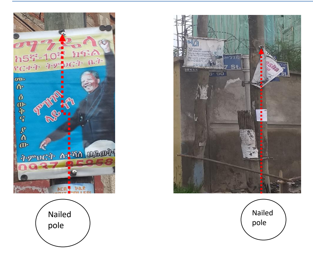
Fig. 6: Nailed, congested, and messed posters in Addis Ababa

Badly nailed poles are often likely to cause considerable damage to the environment and pose a threat to pedestrian safety if the nails fall to the ground. We can see from the second picture above that it is on the verge, despite the fact that it is heavily nailed to the pole. In addition, the text is upside down and the intended message is barely consumed. Basay and Eteng (2021) highlight that the issue also persists in Nigeria. They argue that posters and banners are commonly seen on the walls of residential and public buildings, fences, bus stands, electric poles, kerosene tanks, and even on previously mounted advertisement boards.