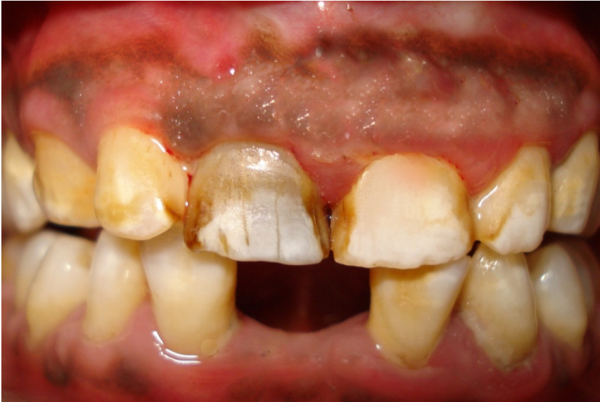
Figure 5: Post operative view of lesion after 6 months