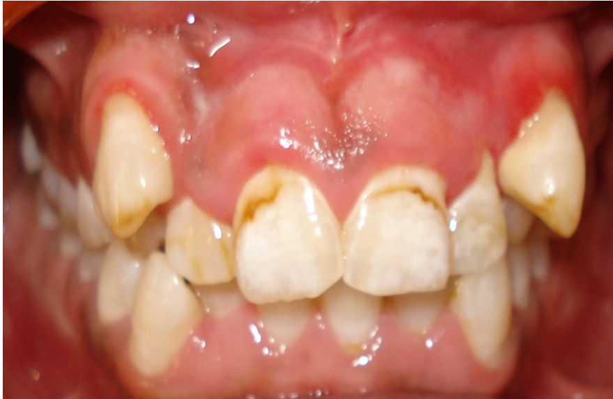
Figure 3: Post operative view of lesion after 8 months