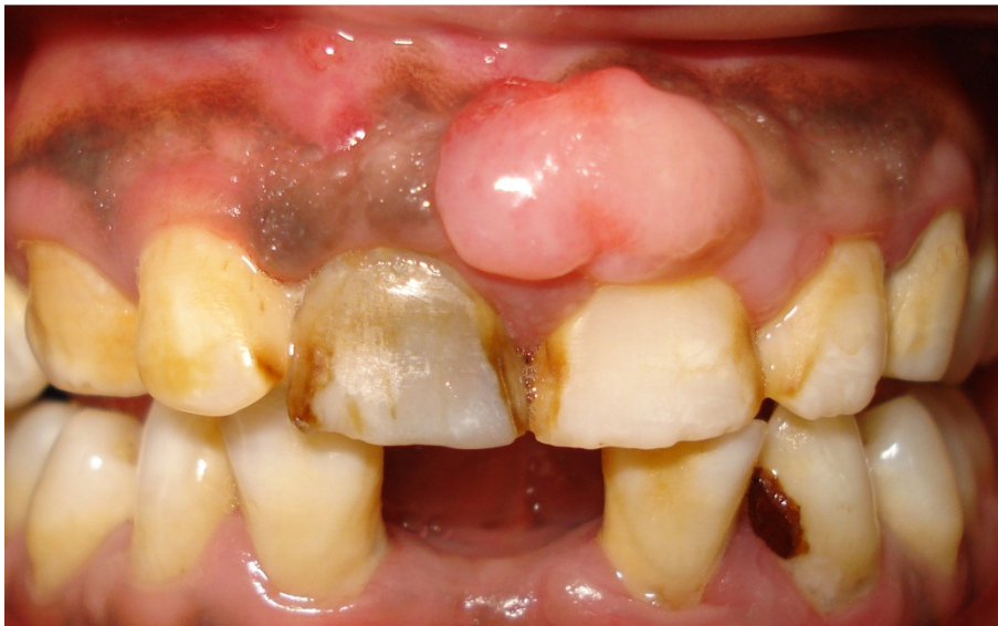
Figure 4: Preoperative view of lesion wrt 11, 21

and round in shape, firm, sessile and non-tender to palpation. The overlying mucosal surface was smooth, not ulcerated and showed no colour change. The lesion was extending from distal aspect of 21 medially to mesial aspect of 11. Excisional biopsy was performed with diode laser (320nm).