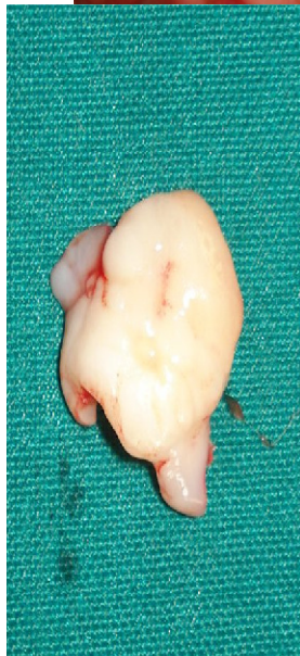
Figure 1: Preoperative view of the lesion