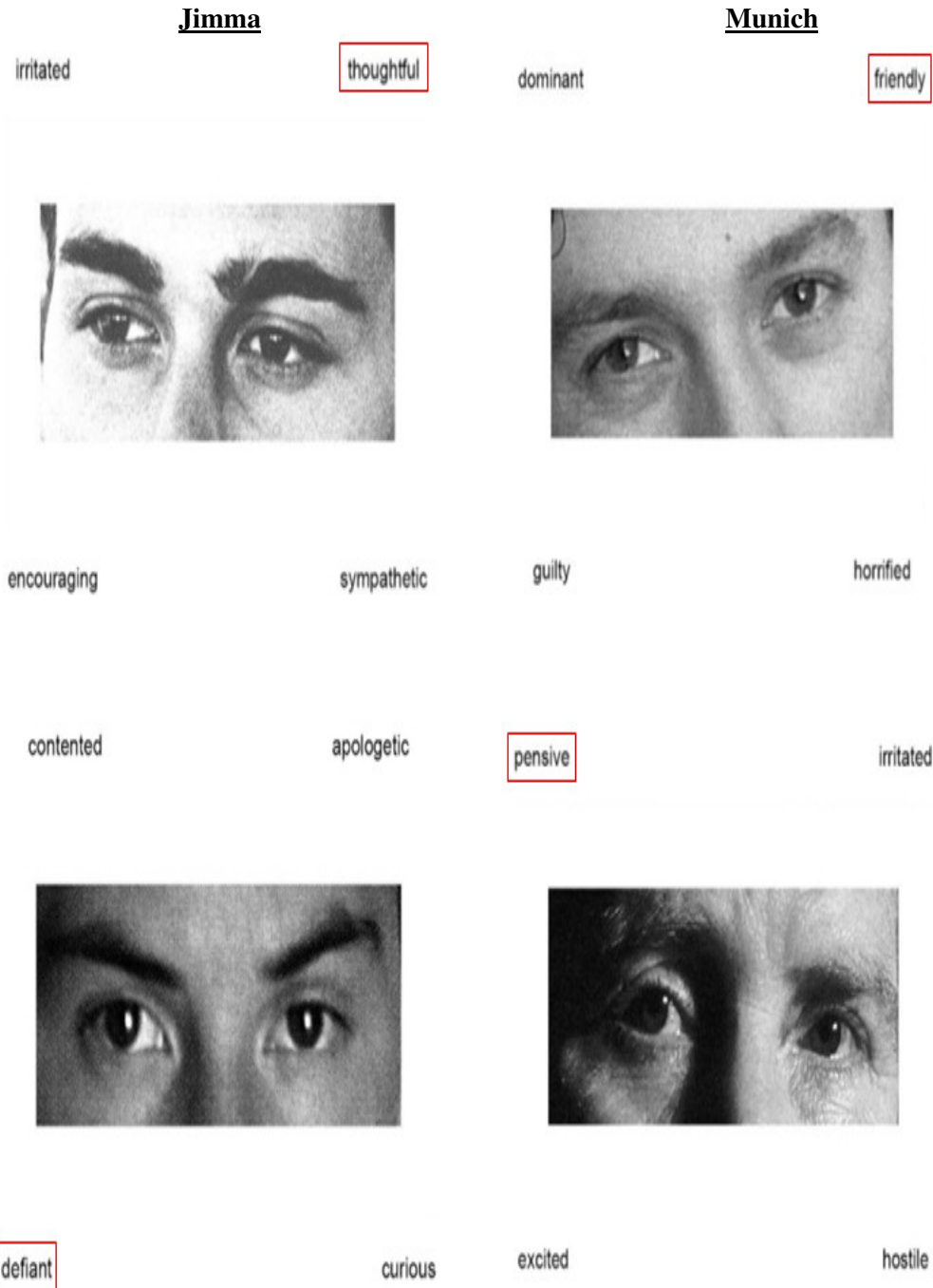
Figure 2: Emotions identified correctly most and least often by first-year medical students in Jimma and Munich in the Reading the Mind in the Eyes test

Within the universities, we found a moderate, positive correlation between the BEES scores and performance in the RME-R test, i.e. between emotional and cognitive empathy. This