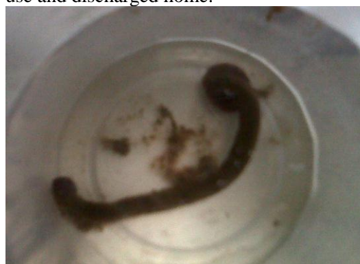
Fig. 2 The leech removed from the patient, JUSH, May 2012.

The child then was taken to the Operating Theater and under general anesthesia laryngoscopy was done and it was found that the upper part of the leech was seen at the level of upper trachea first it looks like a blood clot then it was having movement and forceps was applied to takeout alive leech which measures 6cm. The child then was transferred to the ward with stable vital sign and no active bleeding or sign of respiratory distress. He was observed for 24 hours for development of sign of respiratory distress or any other complication. There was no problem identified then with advice given on the safe water use and discharged home.