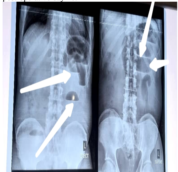
Figure 1: Plain abdominopelvic radiograph showing multiple air-fluid level as indicated by the white arrow.

surgical operation or antecedent trauma to the abdomen. He had neither history of hypertension nor diabetes or other co-morbidities. He was acutely ill-looking, and his vital signs were abnormal. He had intravenous fluid resuscitation. Parenteral antibiotics and analgesia were also commenced immediately. Urgent abdominopelvic ultrasound and plain abdominal x-ray (erect and supine as shown Figure 1) were done which were suggestive of intestinal obstruction. A pre-operative diagnosis of a suspected acute malignant bowel obstruction was made. Complete blood count revealed pack cell volume of 39%, white blood cell count of 14,000 and 76% neutrophilia. Electrolyte, urea and creatinine were; sodium of 140mmol/l, potassium of 3.9mmol/l, chloride of 101mmol/l, bicarbonate of 22mmol/l, urea of 4mmol/l and creatinine of 85mmol/l. All these fell within the normal range. He had emergency laparotomy and intra-operatively appendico-ileal knotting was seen with gangrenous appendix and terminal ileum within 40cm from ileo-cecal junction (Figure 2). The patient had limited right hemicolectomy and ileo-colonic anastomosis. He was discharged on post-operative day 10.