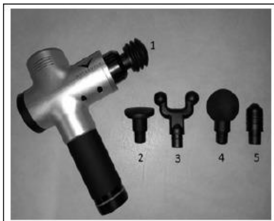
Figure 2. The handheld massage device (Hypervolt) with the different attachment heads which can be used. For this study was used head 4.