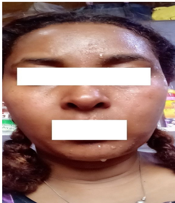
Figure 1: Patient demonstrating feature of Harlequin syndrome: Apparent sweating on the left hemiface with right side anhidrosis

were down-going bilaterally. Sensation was intact for light touch, pinprick, vibration, and position throughout. No coordination abnormalities were detected. Meningeal irritation signs were also negative.