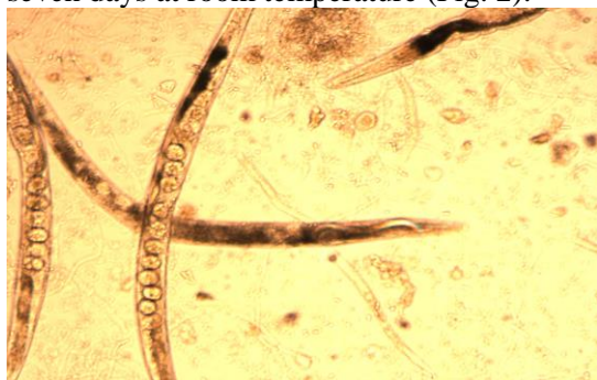
Figure 1: Adults female S. stercoralis worm with eggs and rhabditiform Larvae obtained from agar plate (Magnification 40X)

The free-living adults were observed after five days of culturing in agar plate culture. In some cases, the eggs were hatched and the rhabditiform larvae were clearly visible inside the body of adult female worms after keeping the plate for seven days which shows S. stercoralis is not only oviparous but also it is larviparous (Fig. 1). In addition, all stages of the life cycles (eggs, rhabditiform larvae, filariform larvae and adult stage) were observed in the present study from a single agar plate culture after keeping the plate for seven days at room temperature (Fig. 2).