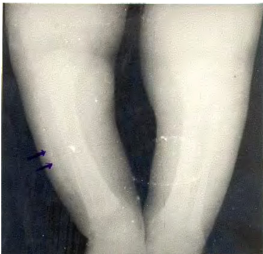
Figure-1. Roentgenogram of the lower extremities showing diffuse subcutaneous calcifications (arrow).

hypercalcemia consisted of intravenous hydration and intravenous Furosemide 1mg/kg 6 hourly, but the serum calcium remained high and started on oral Prednisolone 2mg/kg divided in to two doses. In 72 hours of initiation of prednisolone, serum calcium has normalized (8.2mg/dl) and the drug discontinued gradually after a week. Four weeks after the onset, she started to gain weight and the skin lesion resolved in two months time and she was quite healthy subsequently during her follow up visit for one year.