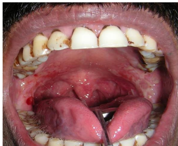
Figure 2: Intra-oral photograph of the patient showing erosive lesions involving posterior hard plate, soft palate, faucial pillars and extending to the oropharynx

Routine haematological and biochemical investigations were within normal limits except