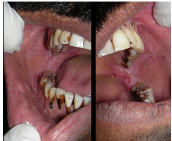
Figure 5: Intra-oral photograph of the patient showing almost complete healing of ulcerative lesions.