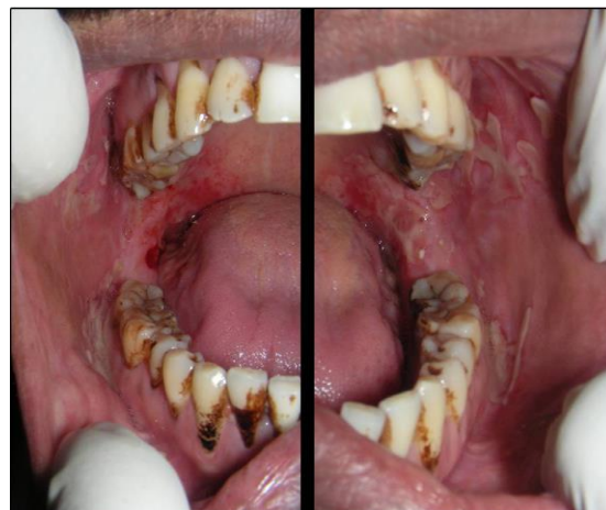
Figure 1: Intra-oral photograph of the patient showing ulcerative lesions present on bilateral buccal mucosa along the line of occlusion; the lesions with irregular borders associated with flaccid bullae in lower buccal vestibule in relation to molar region seen

vesiculo-bullous lesion affecting the oral cavity. Differential diagnosis included pemphigus vulgaris, mucous membrane pemphigoid, bullous lichen planus, para neoplastic pemphigus, chronic ulcerative stomatitis, recurrent herpes lesions in immunocompromised patients and erythema multiforme.