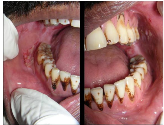
Figure 4: Intra-oral photograph of the patient showing reduction in the size of the lesions and reduction in the erythema and inflammation associated with it

Pemphigus vulgaris is a rare cause of chronic ulceration of the oral mucosa. The mouth may be the only site of involvement for a year or so. In this case, early diagnosis and lower doses of medication for shorter period of time was could control the disease.