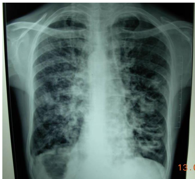
Figure 1: Chest X-ray PA view showing multiple cystic spaces with air-fluid levels over the mid and lower zones of either side, implicating cystic bronchiectasis with secondary infection. There is also transposition of the heart and gastric air

showed an obstructive air way defect. On semen analysis, sperm morphology and count were normal but sperm motility test revealed plenty of immotile sperms. The sperm motility index was 16% (normal is >50%). The patient was diagnosed as a case of Kartagener's Syndrome after establishing the clinical triad of sinusitis, bronchiectasis and situs inversus in him. He was treated with antibiotics, bronchodilators and mucolytic agents, and there were signs of improvement. The prognosis was explained to the patient.