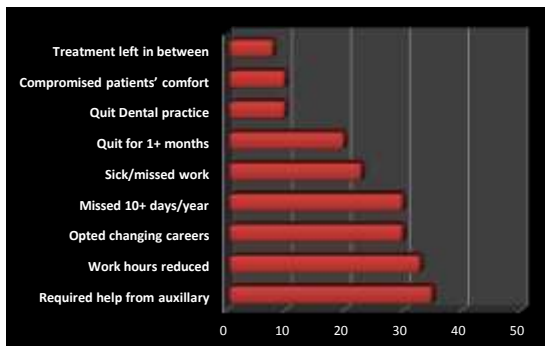
Fig 2: Work and Career disruption among respondents due to WRMSD

Effect on work schedule and career: Figure 2 shows job disruption among dentists as a result of WRMSD. Individuals who used CAM therapies alone, compared with individuals who used both CAM and conventional therapies, had 5 times lower odds of temporarily quitting work for longer than 1 month (OR=4.7, 95% CI =1.3 to 20.8).