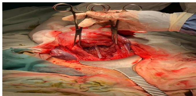
Fig (3): CuT380 IUD inserted intra-caesarean using our new technique. (Kasralainy Obgyn Operation theatre).