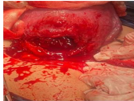
Fig (2): CuT380 IUD inserted intra-caesarean using standard approach. (Kasralainy Obgyn Operation theatre)