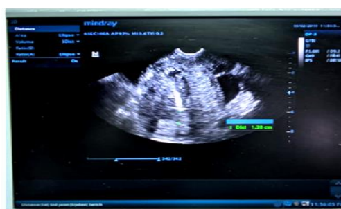
Fig (4): Trans vaginal US 6w follow up of CuT380 IUD inserted intra-caesarean (Kasralainy Obgyn Outpatient clinic).