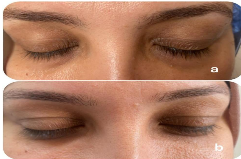
Figure (2): A 42-year-old female with TTD. (a) pre-treatment with nanofat. (b) at 3 months follow-up, the right side showed good improvement and the left side showed great improvement.

For dermoscopic assessment, the patients were 40% pigmented, 40% mixed and 20% vascular as in Figure (3).