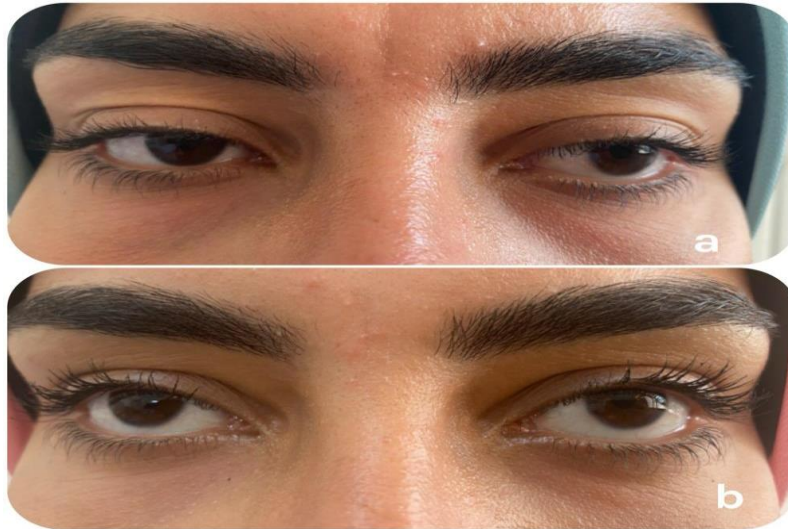
Figure (1): A 29-year-old female with TTD. (a) pre-treatment with nanofat. (b) at 3 months follow-up, both sides were greatly improved.

Figures (1, 2) show some results of nanofat technique.