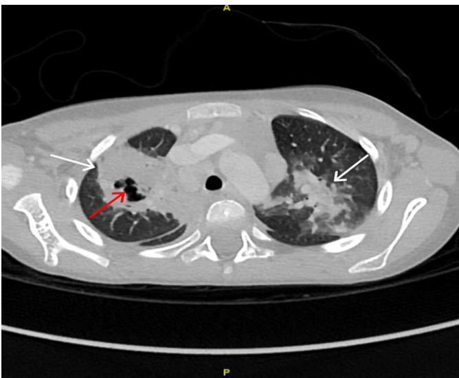
Figure (2): Contrast-enhanced chest computed tomography (CT) confirmed bilateral pneumonic consolidation (white arrows) with cavitation (red arrow)

The patient was administered ceftriaxone and azithromycin for two days and received two doses of intravenous immune globulin (IVIG) along with low-dose aspirin (4.6 mg/kg/day). However, no resulting improvement was noted in the fever pattern. Subsequently the patient was administered vancomycin and tazocin to control persistent high-grade fever, as recommended by the infectious disease team. A differential diagnosis of complicated pneumonia was made. In the following days, the fever persisted with associated thrombocytosis (highest count was 842). Echocardiography was performed on the ninth day of illness, which showed normal function and anatomy of the heart with no dilatation of the coronary arteries. Contrast-enhanced chest computed tomography (CT) confirmed bilateral pneumonic consolidation with cavitation (Figure 2).