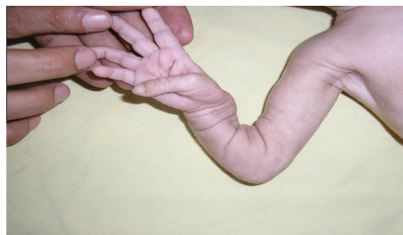
Figure 2 Proximal insertion of the thumb, arachnodactyly with flexed thumb, and incomplete skin folds in the forearm.