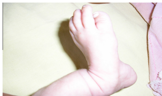
Figure 3 Short big toe with long other toes.