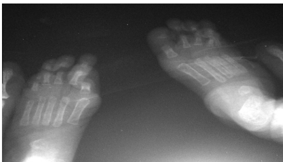
Figure 6 Short first tarsal and metatarsal bones especially of the left foot.