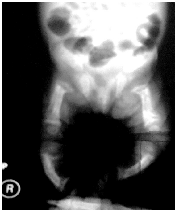
Figure 5 Congenital bowed tibia and fibula, and evidence of ricket.