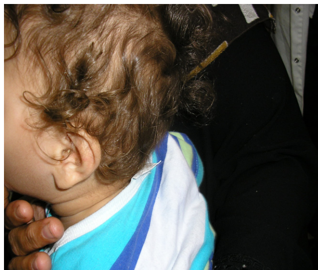
Figure 2 Demonstrates large, low set, posteriorly rotated ear with large ear lobule.

with two upper and two lower teeth. There was slight micrognathia. The neck was short and skin over it was loose and folded (Figs. 1 and 2).