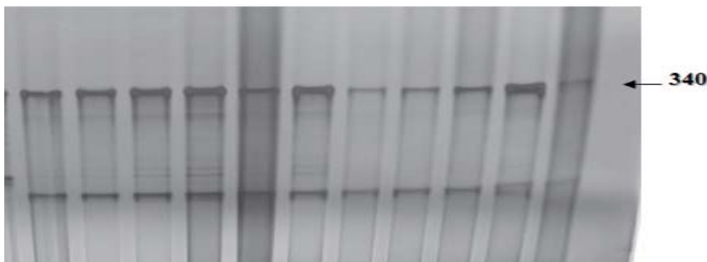
Fig. 4: SSCP chart for Caveolin 3. Lanes 15- denotes controls and 614- denotes DMD cases. Mutation is observed in case 10.