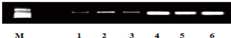
Fig. 1: Caveolin 3 mRNA relative expression in DMD patients compared to controls. Lanes 13- are controls and lanes 46- are DMD patients. It is evident that DMD patients have a higher expression of Caveolin-3 mRNA compared to controls.