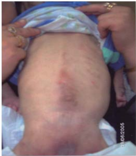
Fig. 1C: Scleroderma like areas.

Laboratory investigations: Mild hypochromic anemia with anisocytosis, leucocytosis and marked thrombocytopenia. Bleeding and clotting times were within normal. ESR and CRP were both elevated. Normal liver and kidney function tests. Normal blood ammonia level. Low serum albumin (2.8 gm/dl) and total proteins (4.7 gm/dl). Normal blood and urinary aminograms.