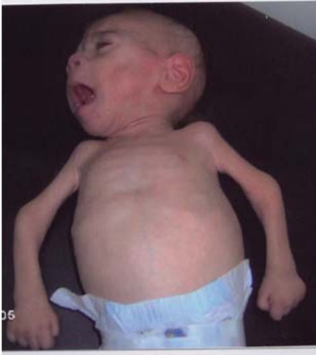
Fig. 1B: Tough indurated skin with limitation of joint mobility.

The skin is tough indurated over the entire body with limitation of joint mobility and scleroderma like areas (Figures. 1-B,C). He had pectus excavatum, widespaced nipples, normal heart and chest by auscultation, rectal prolapse and normal male external genitalia. Neurological examination could not be conducted because of the tough skin and contracted joints.