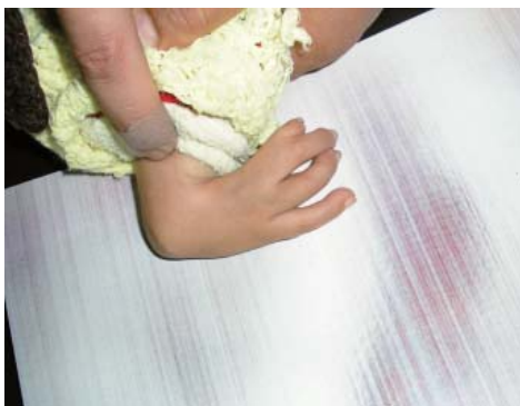
Fig. 3: MURCS association with radial club hand, absent thumb, hypoplastic index in addition, syndactyly between index and middle fingers.

Plain X ray of vertebrae showed hemivertebrae and fusion of cervical and dorsal vertebrae with supernumerary ribs and fusion on the right side. Right upper limb showed absent head of humerus, deformed humerus and ulna with malalignment of ulna, absent radius, one carpal bone (Versus 3 on left side), 3 metacarpal bones, absent thumb and rudimentary index finger phalanges, Figure(4).