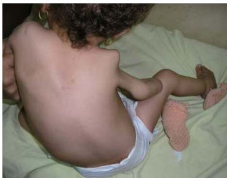
Fig. 2: MURCS association with scoliosis, low hair line, elevation of left shoulder blade and hemangioma over back.