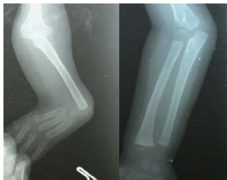
Fig. 4: Plain Xray shows right ulna with malalignment, absent radius, one carpal bone (Versus 3 on left side), 3 metacarpal bones, absent thumb and rudimentary index finger phalanges.

Plain X ray of vertebrae showed hemivertebrae and fusion of cervical and dorsal vertebrae with supernumerary ribs and fusion on the right side. Right upper limb showed absent head of humerus, deformed humerus and ulna with malalignment of ulna, absent radius, one carpal bone (Versus 3 on left side), 3 metacarpal bones, absent thumb and rudimentary index finger phalanges, Figure(4).