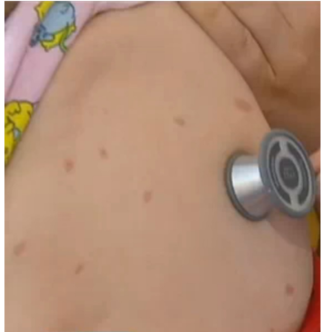
Fig. 2. The multiple capillary malformations on the trunk.

The first publication of Canadian pediatricians described two boys from unrelated families who had similar clinical manifestations [1]. A unique feature of both children was the presence of congenital multiple randomly placed red spots (“port-wine stains”) on the skin, which were the result of abnormal capillary development (or capillary malformations). Both patients had progressive microcephaly, neonatal resistant seizures, psychomotor retardation, similar craniofacial anomalies, short fingers, and toes with nail hypoplasia. Brain MRI detected diffuse cortical atrophy, thinning of the corpus callosum, and delayed myelination of the white matter of the brain in both children. Such a high level of similarities of the phenotypic manifestations in two patients allowed the authors to classify this condition as a new syndrome. However, the cause of the syndrome was not clear.