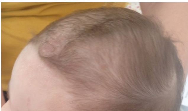
Fig. 1. Note unusual hair growth into a “Mohawk” pattern.

Since this disease has been described quite recently, and there are only 14 published cases to date, we want to focus on the characteristics of these cases.