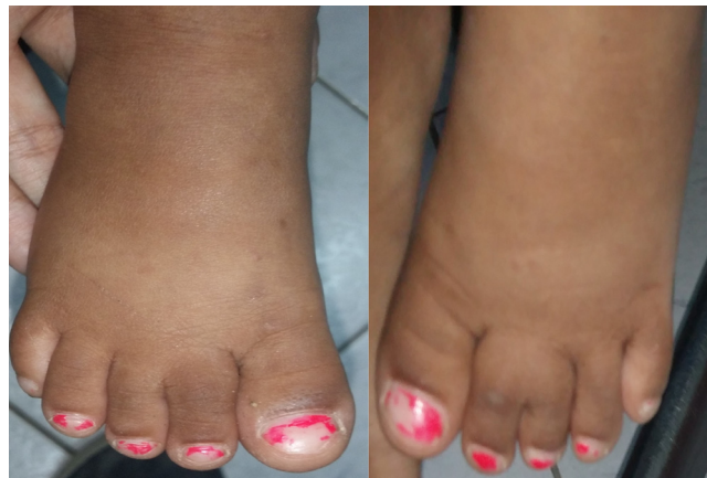
Figure 3 Bilateral partial syndactyly between 2nd and 3rd toes.

Cardiac examination was apparently normal. Abdominal examination revealed scar of Nissen Fundoplication procedure (Fig. 4).