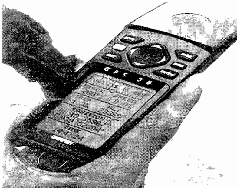
Figure 1 Hand-held GPS receiver, in use at position 13.35967 °N and 39.52304 °E