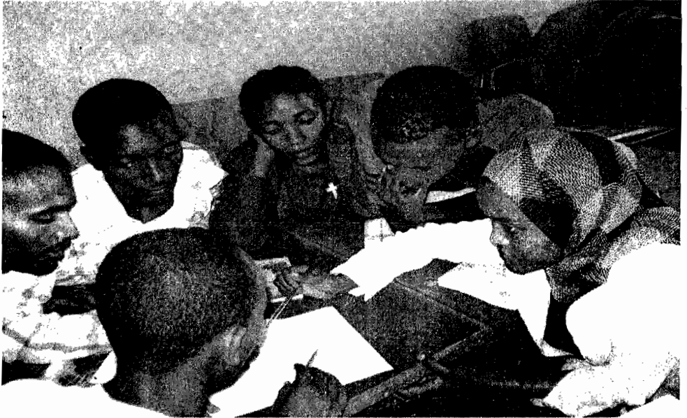
Active learning methods : inspiring; Moderations in Mittu, May 2007