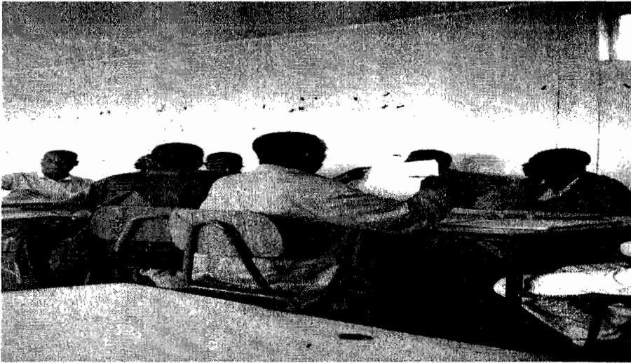
Moderations in Bonga: HDP-lesson action research proposals; may 2007

The HDTs and HDP candidates are highly involved in the attitude of coaching and skills and knowledge. HDTs are involved in joining the weekly meetings of the HDLs, HDMs and HDC.