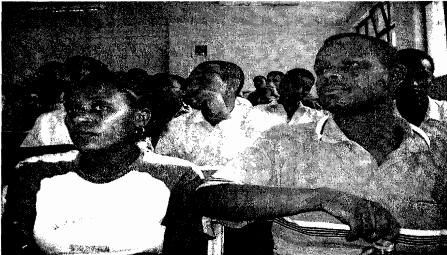
Seminar on teachers professional development April 2007 Jimma University

The four main tasks for each leader working in this powerful participative learning environment are: