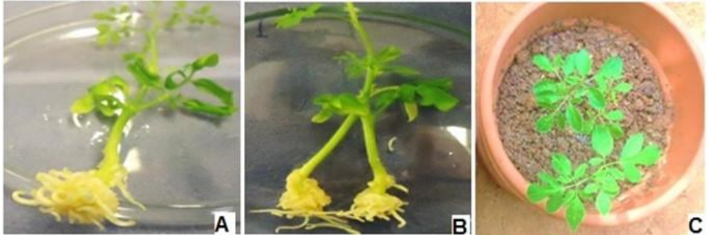
Fig. 2. In vitro rooting and acclimatization of Moringa oleifera . (A) Rooted shoots on half strength MS medium containing 0.25 mg/l NAA; (B) On 0.5 mg/l NAA; (C) Plants after 30 days of acclimatization.

Means with the same letter within a column are not significantly different at p < 0.05 .