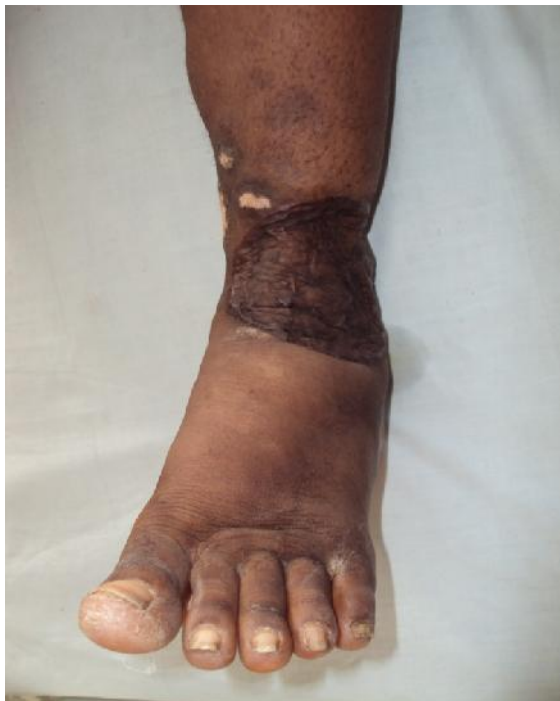
Figure 2. Post operative picture showing the grafted site of the excised ulcer