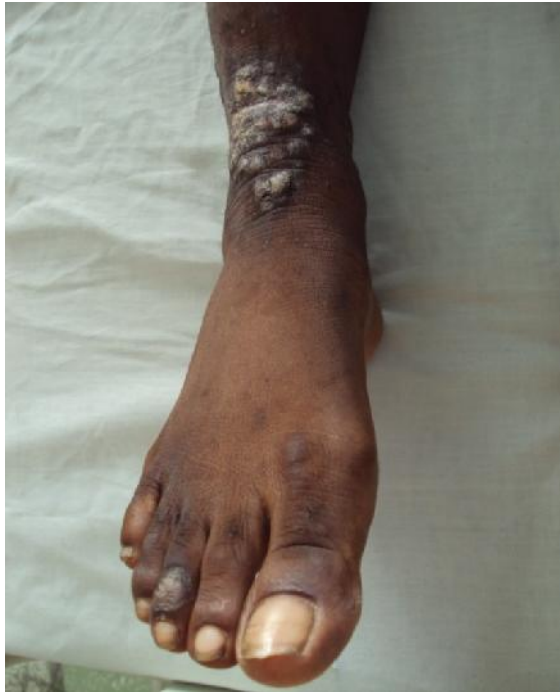
Figure 1. Lichen planus on contra-lateral leg

hyperchromatic to vesicular nuclei with eosinophilic cytoplasm. Also seen were keratin pearls and individual cell keratinization. There was ulceration of the underlying epithelium. All the margins of resection were free of tumour. A histological diagnosis of invasive squamous cell carcinoma was made with associated inguinal lymph node metastasis (Figure 4). She declined a planned groin dissection and rather consented to post operative adjuvant radiotherapy.