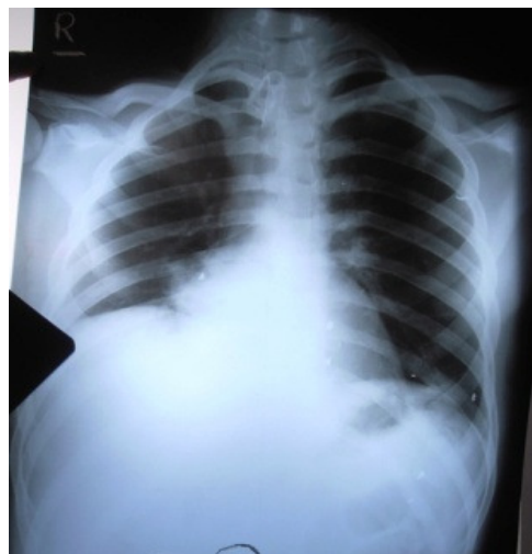
Figure 6. Three days after, Lung still expanded.