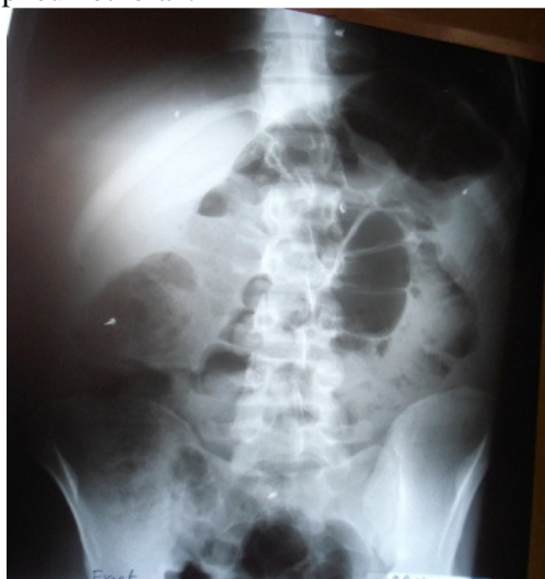
Figure 2. Abdominal radiograph showing shrapnel inside the right upper quadrant.