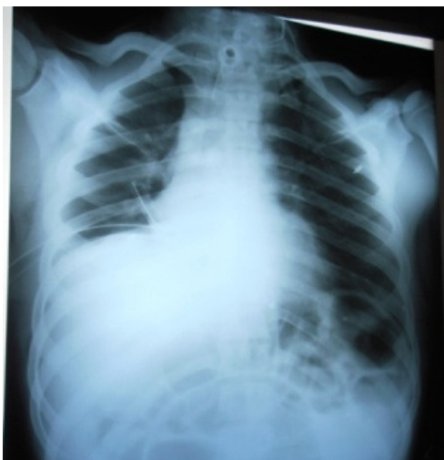
Figure 5. On table radiograph after tracheostomy and bronchial lavage shows re-expanded right lung.