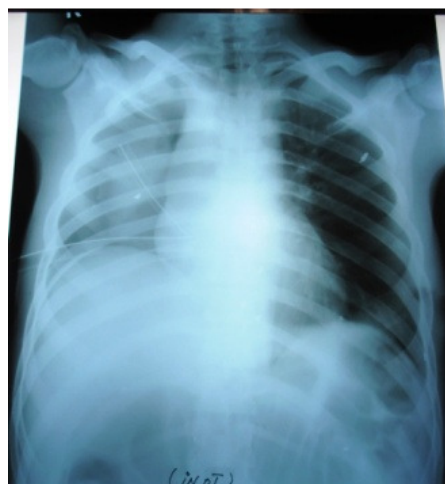
Figure 4. Radiograph on table demonstrates collapsed right lung with intra-pleural chest tube.