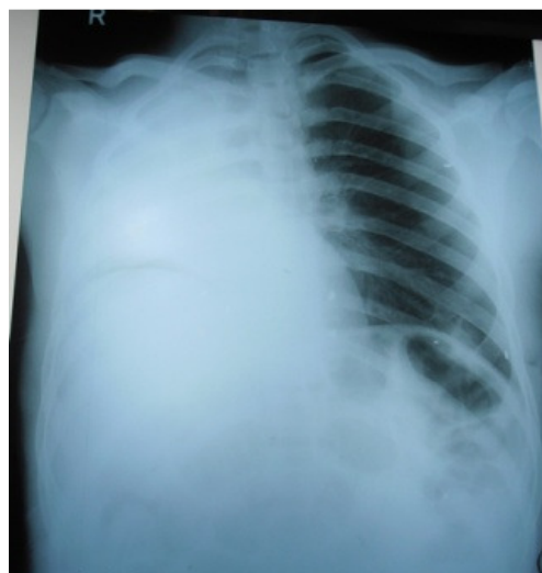
Figure 3. Plain radiograph of chest shows complete opacity of right lung field with tracheal deviation to the right.