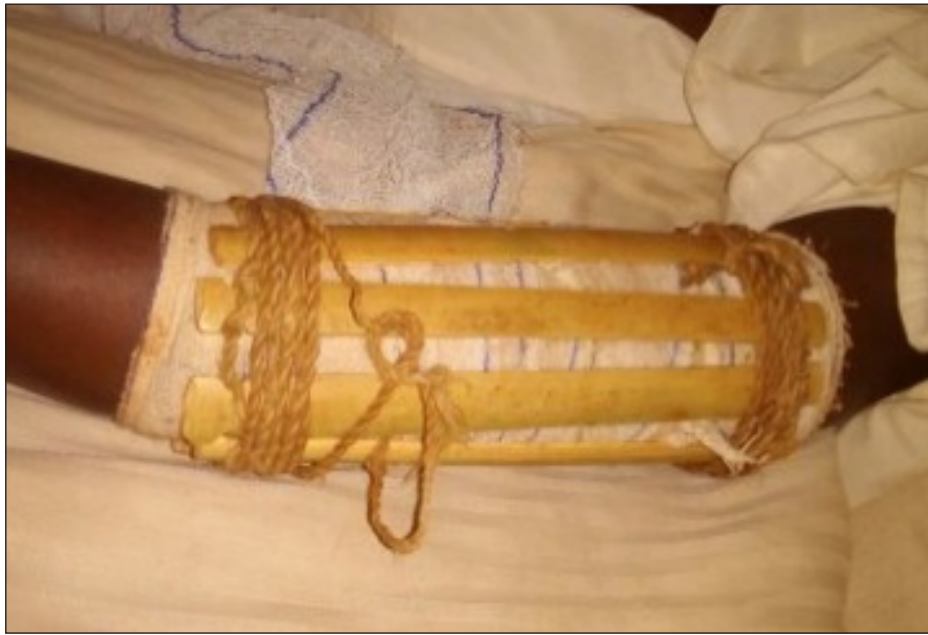
Figure 3. Splinting and bandaging of a fracture by a traditional bonesetter