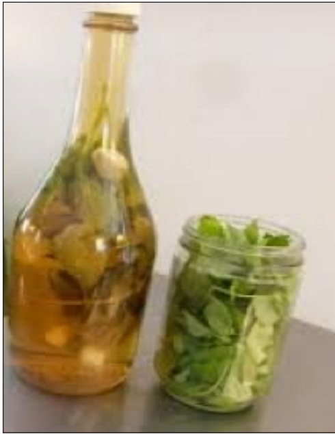
Figure 5. Herbal alcohol analgesic cocktail used by traditional bones setters