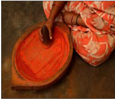
Figure 7. Traditional bonesetter on duty preparing an herbal concoction