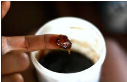
Figure 4. Herbal concoction blended into a cream

the flesh would not heal if there are any broken bones inside it. And if there is an open wound, you apply a paste made of procaine mixed with shea butter into the sore before applying a splint and then tie it up.