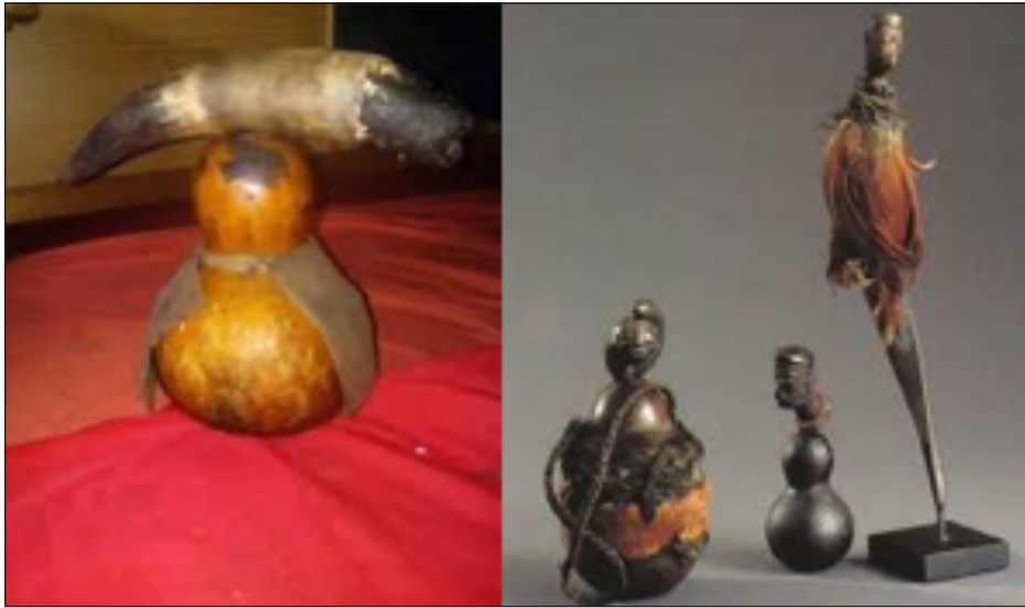
Figure 6. Traditional small gourds and amulets used as charms to ward off witches and wizards

five patients thought they are competent. Thus on a whole, all respondents were of the view that the Bonesetters are competent. Consequently, the level of education of respondents does not appear to influence assessment of the level of competence of TBSs at the Center. Justifying her view, a 35-year old female farmer contended that: “they have the requisite skills” . Other views expressed include remarkable improvement in injury situation since first visit to the Centre. A 60-year old visually impaired female farmer claimed that: “they are very competent because I have experienced great improvement since I was brought here” . The situation here totally agrees with the assertion by Onuminya in 2004 [6] that traditional bonesetters are considered the views of Hag et al [25] and Agarwal et al [20] who describe TBSs as quack, with no skills and ‘unqualified practitioner’ respectively. Hag and Hag et al [25] contend that “TBSs develop their skills and experience by practice (trials and errors)” . And indeed similar views were expressed by two directors of health. A medical director contended that: “they use psychology to treat; they actually do try and error” . Similarly, a director of health services argued that: “they do try and error. After all, in first aid if you put splint on somebody and you tie and you leave the person over a period, the person recovers . . . having practiced for some time they would definitely have some skills.”