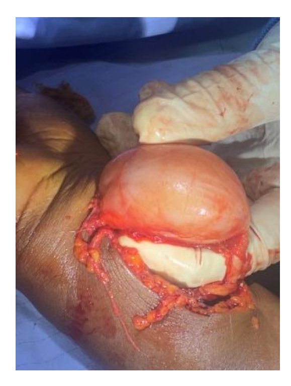
Figure 3. Showing intraneural locations of the tumour and nerve fascicles overlying it

location with nerve fascicles overlying it [Figure 3]. This corresponds to a type 3 tumour. The tumour was enucleated by a longitudinal incision between nerve fascicle visible to the ordinary eyes [Figures 4 & 5]. The nerve sheath was repaired and dead space obliterated and wound closed without repairing subcutaneous fascia.