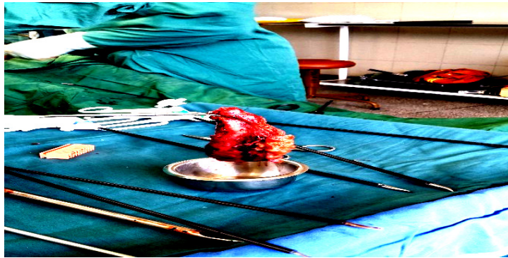
Figure 1: Gallbladder Specimen from Case 1.

Both patients had an uneventful postoperative recovery period and were subsequently discharged. The histology of the first patient reported "sections from the gallbladder show suppurative inflammation with necrosis consistent with a gangrenous cholecystitis". The histology of the second patient reported "the gallbladder wall shows complete hemorrhagic necrosis consistent with torsion. Conclusion is gallbladder gangrene". Repeat LFTs of both patients after 2weeks were normal.