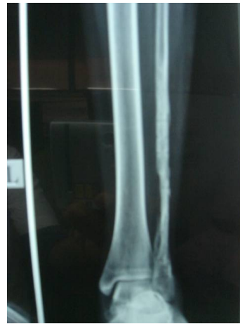
Figure 4. X – ray after implant removal