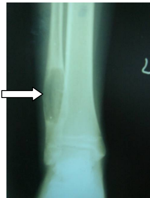
Figure 1. Anteroposterior Radiograph of Ankle suggestive of Osteolytic Lesion in Distal one third of Fibula

A 15 yrs old female came with complaint of pain in left lower leg for 3 months, which was moderate to, severe in nature. Clinical examination revealed swelling and tenderness on the anterolateral aspect of left lower leg. A diffuse non-tender oval swelling of 6 x 4 cms was present over the left lower leg, lateral aspect, the overlying skin was normal and there was no rise local in temperature. Swelling was fixed to the underlying bone smooth surface, hard and bony in consistency. There were no palpable or audible bruits distal pulsations were palpable.