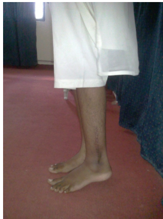
Figure 5. Clinical Picture of Ankle, patient walking full weight bearing