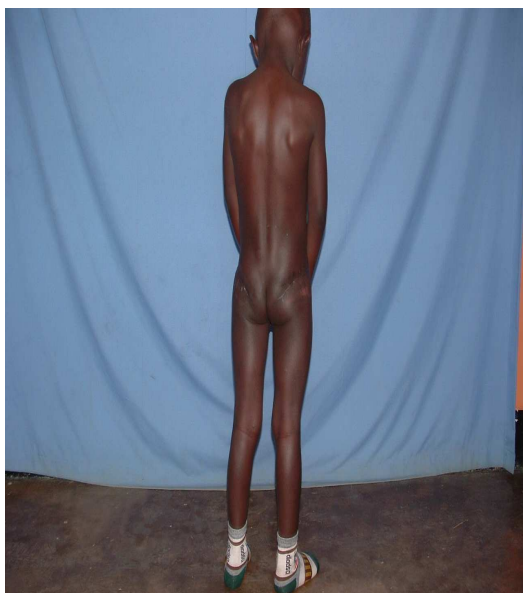
Figure 4. Good Postoperative Results

The condition was always bilateral. The child could not sit except in a high chair, then with a marked flexion of the lumbar spine. Squatting was difficult and only in frog position