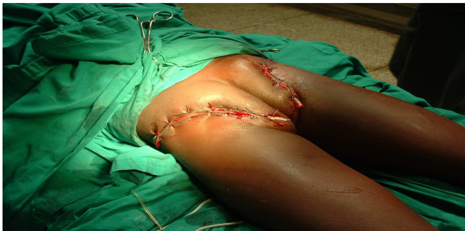
Figure 3. Immediate postoperative case

Ten more cases had a similar pattern above as in cases summarized in Table 1.