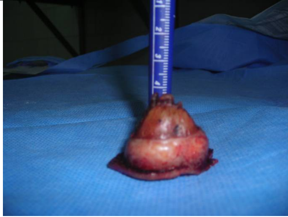
Figure 2. Completely excised lesion including the base of the horn and a rim of normal scalp tissue ready for histopathology examination.