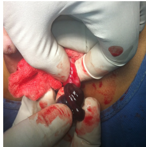
Figure 2. Intra-operative Appearance of Twisted Testis