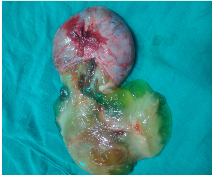
Figure 1. Gross Appearance of Mucin Filled Right Ovarian Cyst

restricted mobility. Same mass was felt through anterior and lateral fornices on vaginal examination. Ultrasonography of whole abdomen showed ascites with a large 18x 15 cm hypoechoic right adnexal mass with multiple internal septations and uterus, liver, gall bladder, spleen, kidney, urinary bladder and appendix appeared normal. CECT pelvis also showed a large well defined rounded hypodense mass lesion in pelvic region arising from right adnexa with CT attenuation value of 5-10 HU with fluid content and mild enhancing walls and normal left adnexa and uterus.