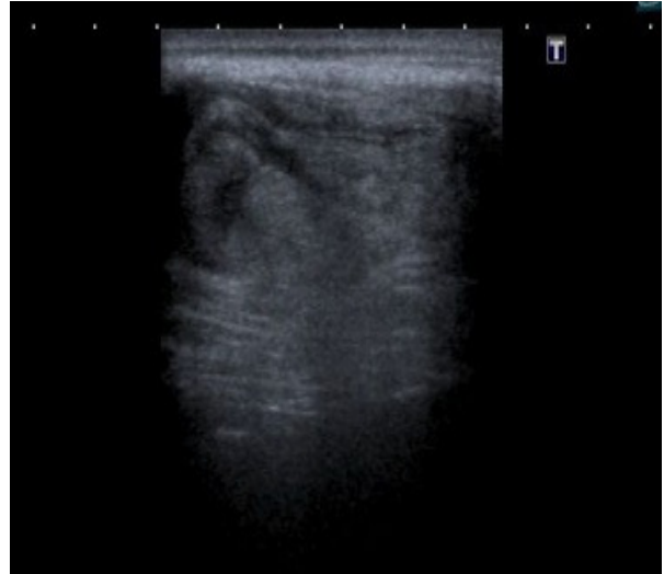
Figure 4: Review ultrasound which was done immediately after CECT and 24r hours from initial US, showed that the cystic lesion was sub totally filled with echogenic fat.

subcutaneous fatty mass with thin marginal rim of fluid. No bowel loop inside. Right kidney is seen in its normal location.