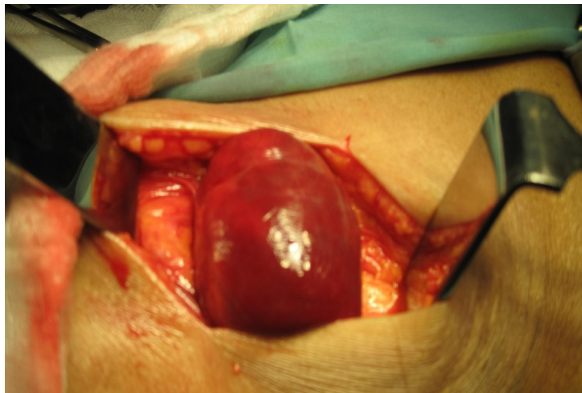
Figure 5: Intraoperative photograph showing defect and protruding hernia sac.