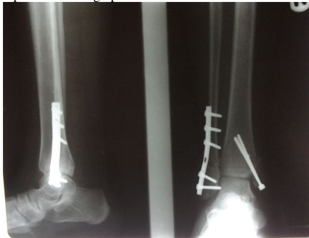
Figure 3. Postoperative Radiograph of a Patient Who Had ORIF for Ankle Fractures

Twenty patients (28.6%) had been involved in motor vehicular crashes. Motorcycle injuries accounted for 16 (22.9%) and falls for 22 (31.4%) of the cases. There were 8 (11.4%) pedestrian road traffic injuries and 2 (2.9%) patients each were involved in assaults and bull fights respectively. The average follow-up period was 18 \pm 1.3 weeks. Methods of open reduction and internal fixation of ankle fractures is shown in figure 2 and a postoperative x-ray in figure 3. Time to union averaged 12.6 \pm 4.1 weeks. (Range 6-20 weeks) Complication rate was 31.4%; wound infection in 14.3% (wound infection rate in closed fractures is 2.9% and 11.4% in open fractures) wound dehiscence with exposed