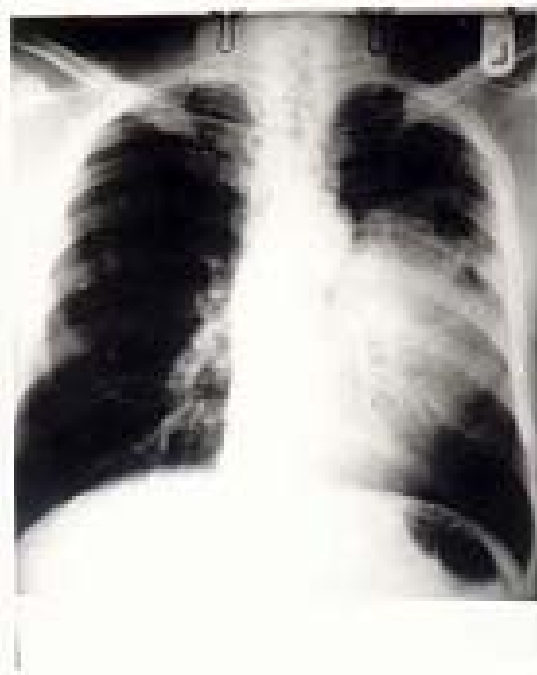
Figure 1. Chest X-ray