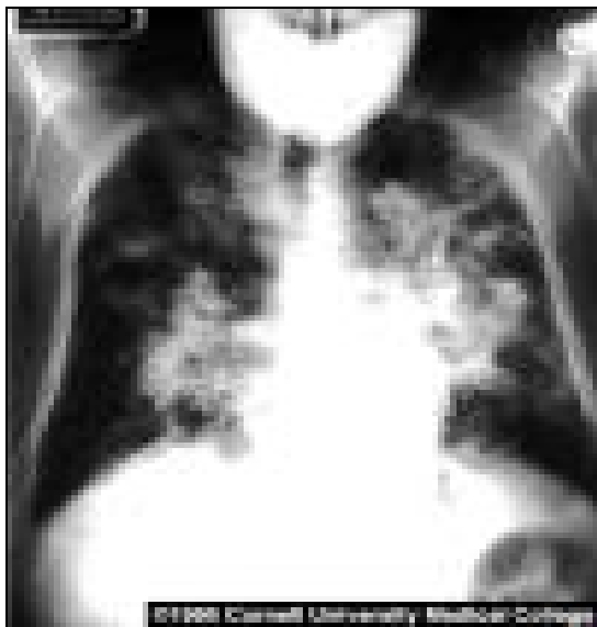
Fig. 3. CXR of a Patient with Pulmonary Kaposi's sarcoma.

sarcoma. A review of the histology was requested and the tissue diagnosis confirmed the same. Double ELISA tests for HIV infection were negative.