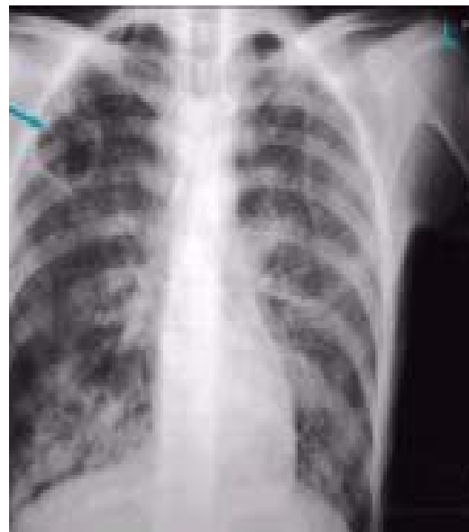
Fig. 4. Chest X-ray of Patient with PCP.

Patients with primary classic Kaposi's sarcoma appear to be at a higher risk of multiple malignancies 5 . Study by Iscovich et al 5 in 1999 when evaluating the risk of second neoplasms in 1,016 HIV-negative patients with primary classic Kaposi's sarcoma between 1961 to 1992 in Jewish population found that 61 (6.0 %) patients developed second neoplasms. The commonest neoplasms were Non Hodgkin Lymphoma and cutaneous malignant melanoma