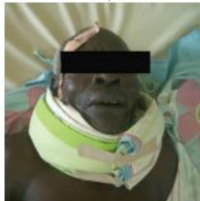
Figure 2 A patient with C3 laminar fractures and bifacet dislocation of C3/C4 has his cervical spine stabilized with a rolled-up bed sheet