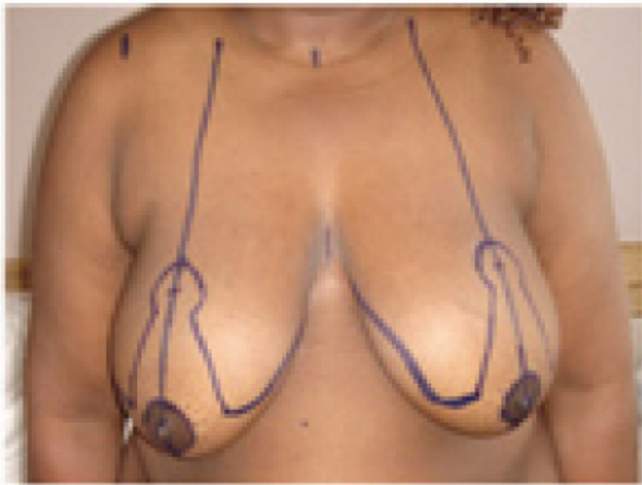
Figure 3a Before frontal view