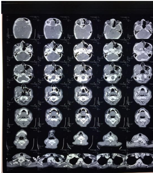
Figure 3 CT PNS showing soft tissue infiltration & destruction of bony margins