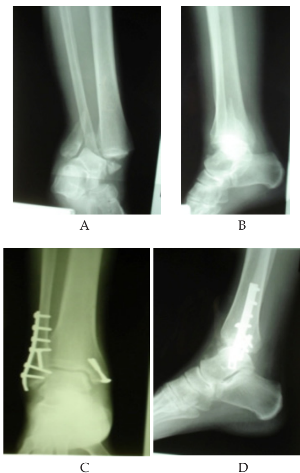
Patient 2: Displaced Trimalleolar Ankle Fracture.

Bimalleolar ankle fracture. Pre-operative anteroposterior (A) and lateral (B) radiographs of the right ankle. Immediate post-operative anteroposterior (C) and lateral (D) radiographs