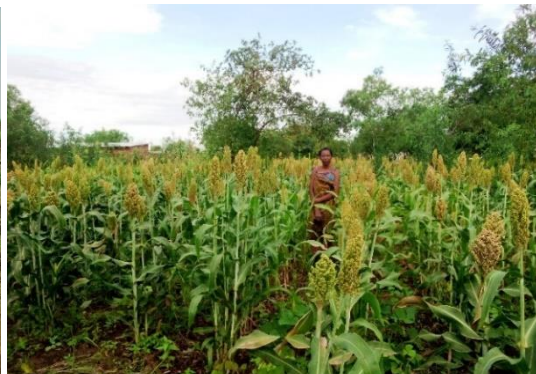
Plate 2: Farmer's participation in the preparation of CA demo plot (minimum tillage) in Chipanga A Village on the left side and cover crops with sorghum on the right side in Mwitikira village