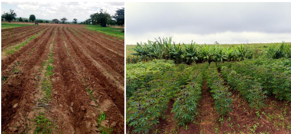
Plate 1: Minimum tillage farming at Chiguluka village

cover as much as possible as reflected in Plate 1 (IRR & ACT, 2005). Although these concepts can be applied in a range of agroecological contexts, their effectiveness depends on the particular site. Therefore, to guarantee good performance, they should always be carefully tailored to the local conditions. However, all CA concepts must be used at once to get good outcomes. Despite the appeal of CA practices, many ideas aimed at encouraging the adoption in Sub-Saharan Africa (SSA) remain constrained (Kuyah et al. , 2021). Tanzanian governmental and non-governmental entities have been advocating for the benefits of CA. However, Tanzania still has a low adoption of CA practices despite numerous initiatives to promote CA (Shetto et al. , 2022).