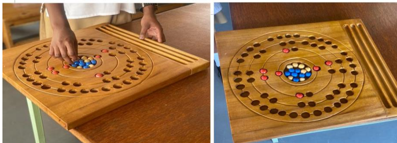
Figure 1: Student designing the electronic arrangement of a nitrogen atom