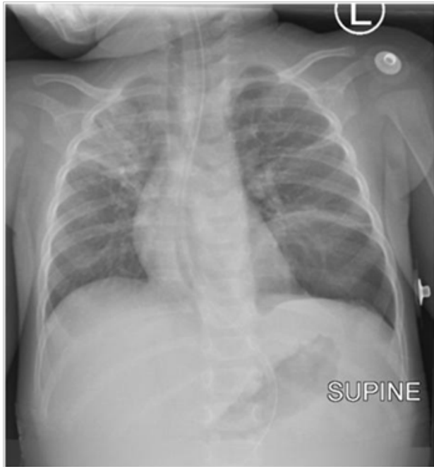
FIGURE 3. Post-operative Supine Antero-Posterior Chest X-Ray

Chest x-ray, no longer shows protruding stomach in the left hemithorax. Consolidation of the anterior segment of the right upper lobe noted in keeping with pneumonia. Atelectatic bands seen in the left mid zone.