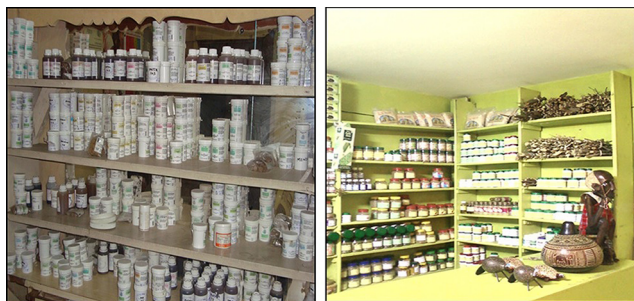
Herbal Products Displayed on Shelves. A, Herbal products sold in herbal chemist or health food stores. B, Herbal products sold in herbal clinic.

We collected HMPs from different herbal vendors across Nairobi County. The study sample included 138 different