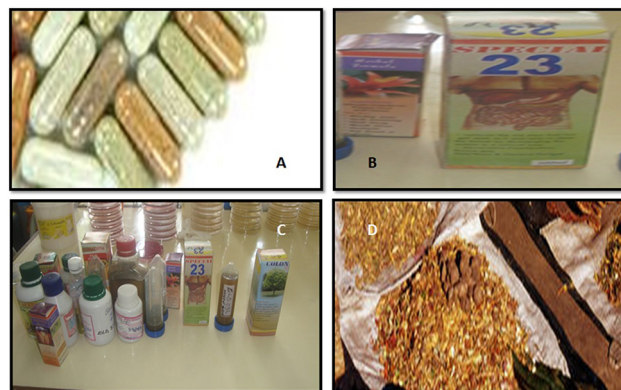
Formulations of Herbal Products. A, Capsules. B, Liquid (concoctions). C, Syrups and concoctions. D, Powdered roots and stem barks.

HMPs in different preparations, which included liquids, powders, capsules, creams/lotions, and syrups.