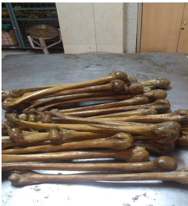
Figure 2: Some of the humerus used in the present study