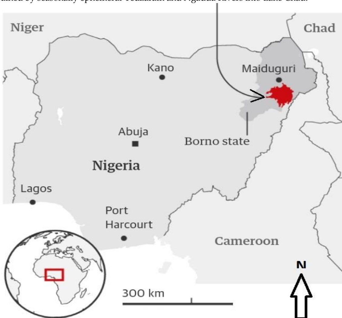
Figure 1 Map of Nigeria showing the study area (Bakari, 2016)

Two groups of rivers drain the Borno region; one is bound towards the south draining to the Benue system while the other is towards Lake Chad (World Bank, 2010). The study area is drained by seasonally ephemeral Yedzaram and Ngadda Rivers into Lake Chad.