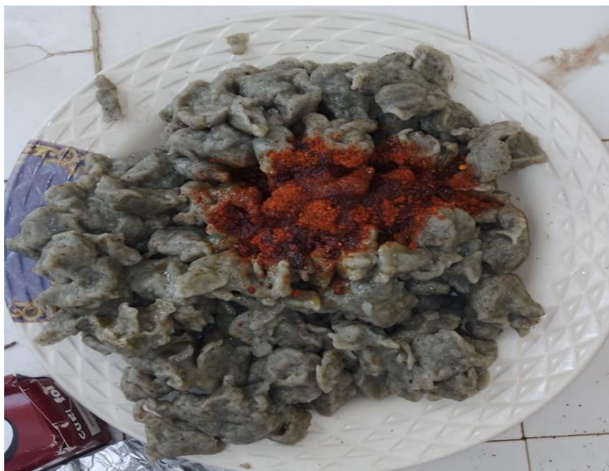
Figure 2: Danwaken Fulawa (Nigeiran beans dumpling made from only procesed wheat flour)