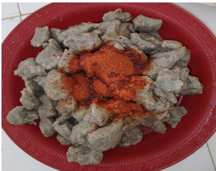
Figure 3: Danwaken Dawa (Nigeiran beans dumpling made from sorghum, cassava and beans)